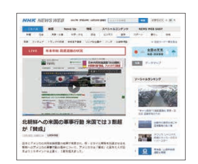
▲ NHK "Japan-US Joint Poll on North Korea" (December, 2017)