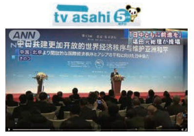
▲ Asahi National Broadcasting "The 13th Tokyo-Beijing Forum" (December, 2017)